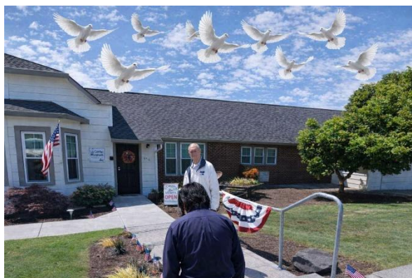
A dream that never happened - Thx you AI