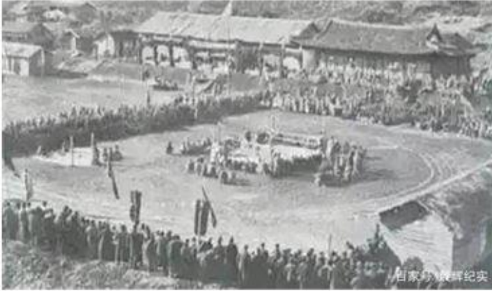
The POW camp organized the "Olympic" games, and the competitors included prisoners of war from 11 countries including the United States, Britain, Canada, France, Australia, the Netherlands, South Korea, the Philippines, Belgium, Greece, and Poland. The competitions included football, basketball, volleyball, and baseball. American football, track and field, gymnastics, boxing, and other forms of events .