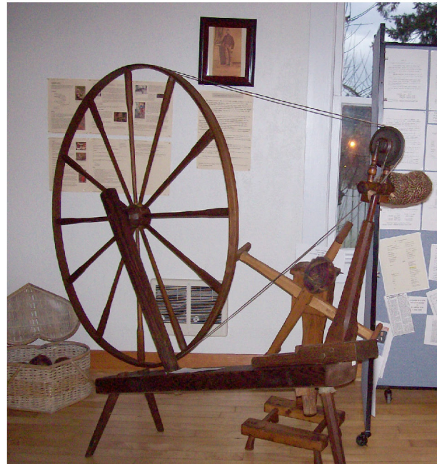
Walking Spinning Wheel