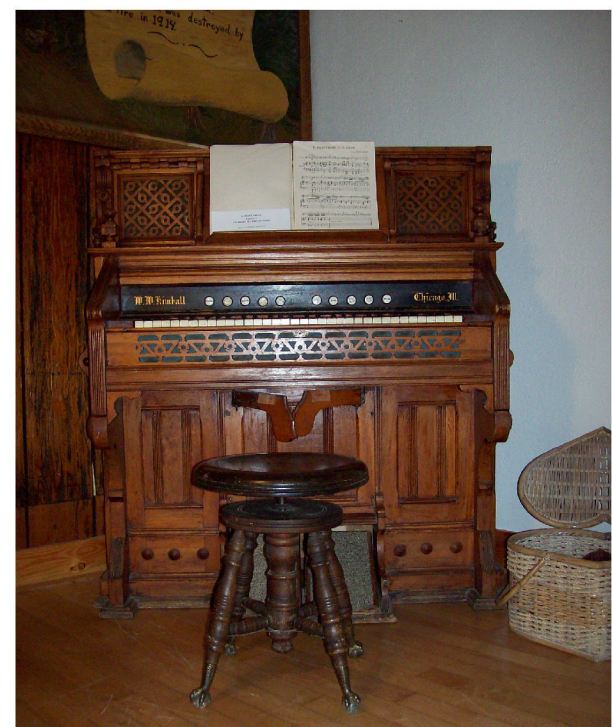
W.W. Kimball Organ

to discuss these forms or to obtain additional information.