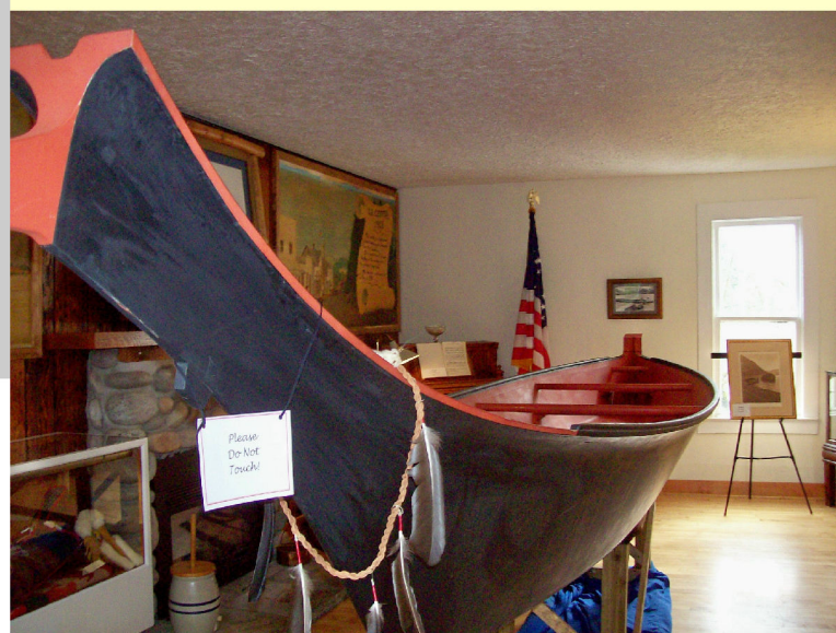
Native American Exhibit: 21' Chinook Canoe

Installation of a Direct Service Line and and Office Equipment Grant